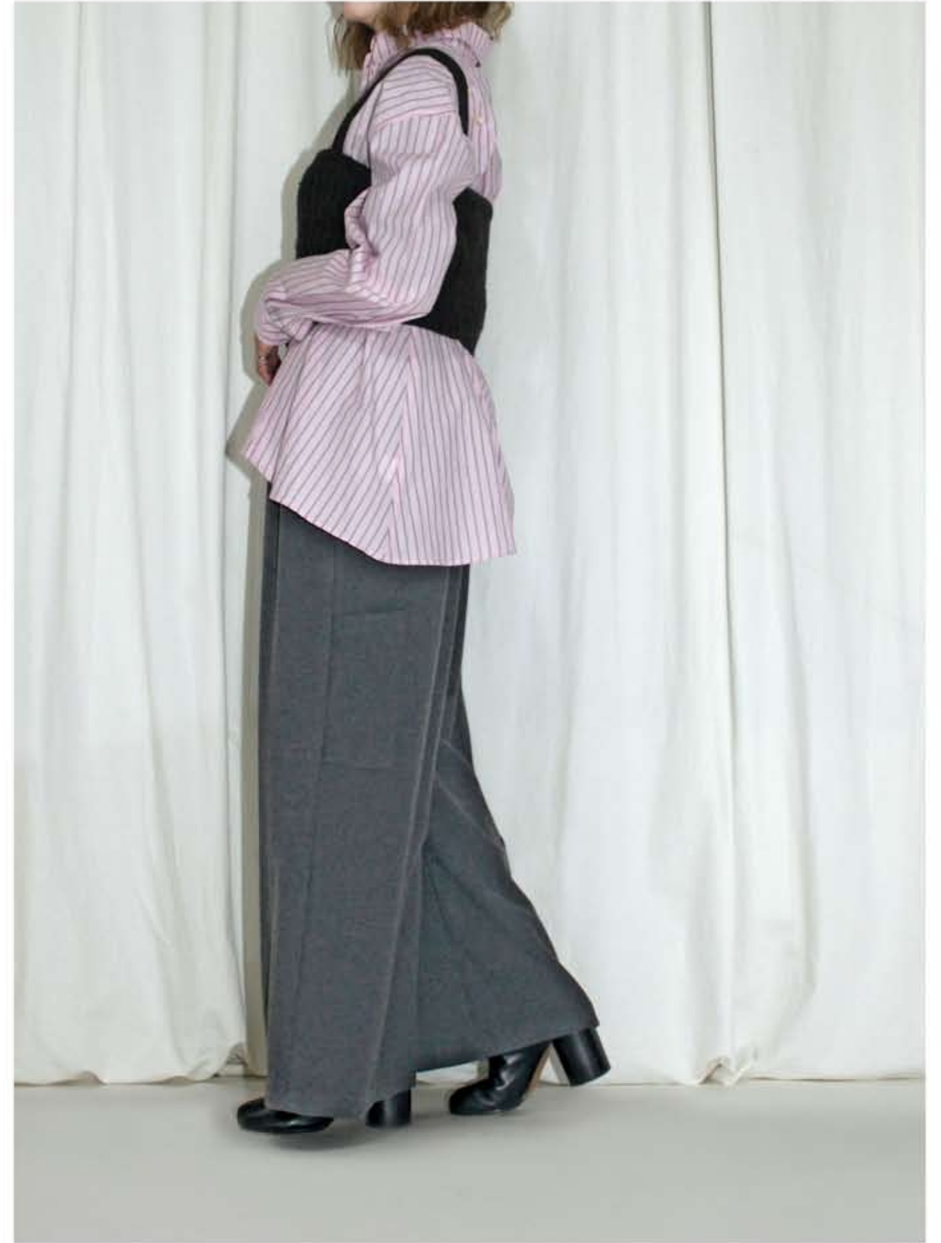
ASYMMETRY SHIRT / RELAX WIDE PANTS