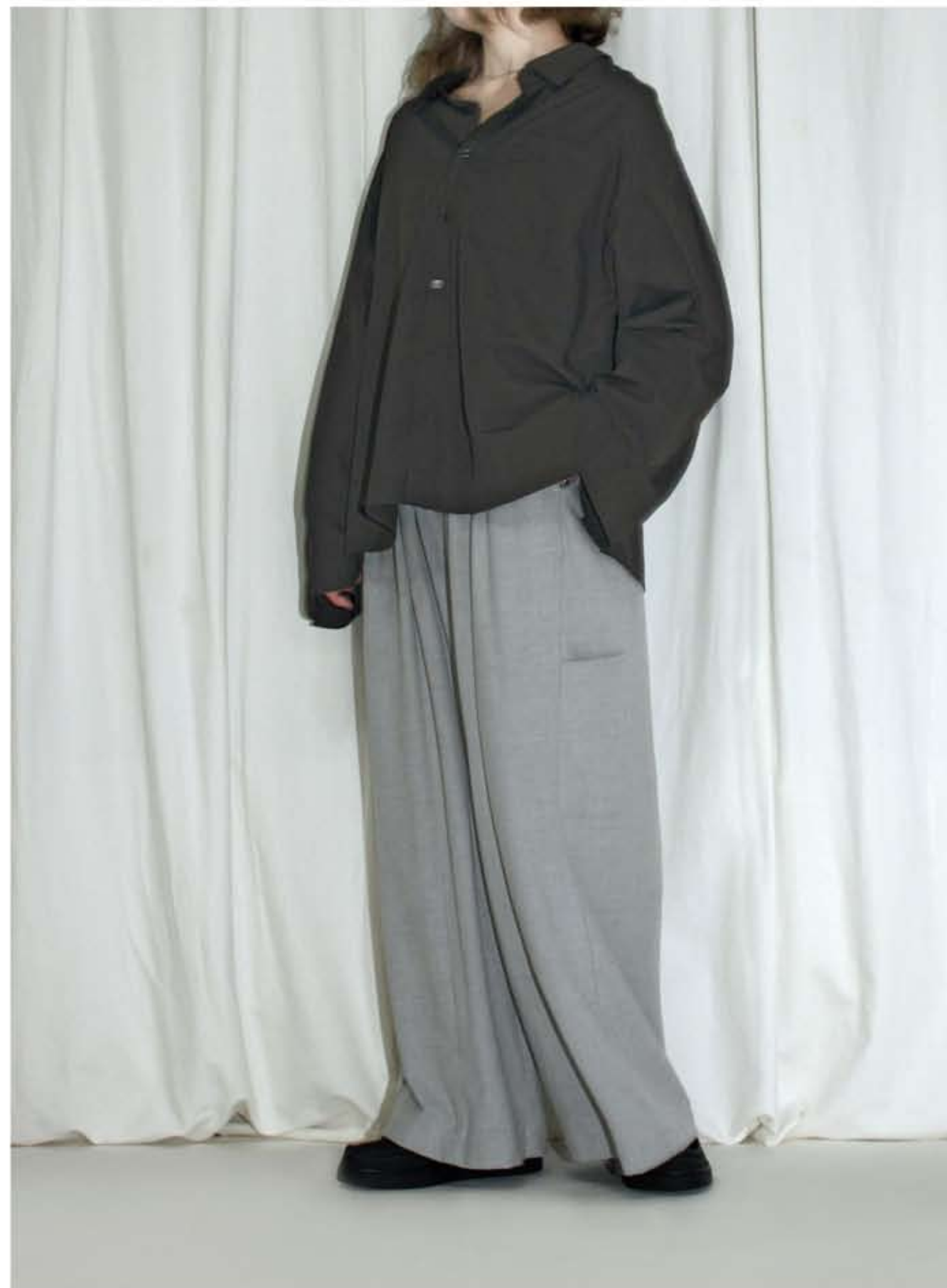
2WAY SLEEVE SHIRT / RELAX WIDE PANTS