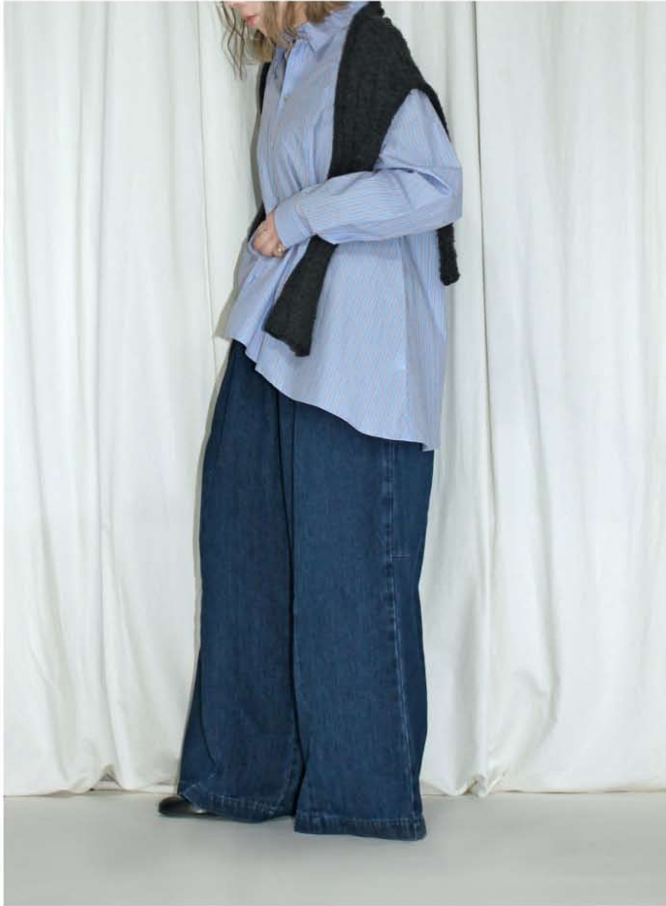
ASYMMETRY SHIRT / DENIM WIDE PANTS