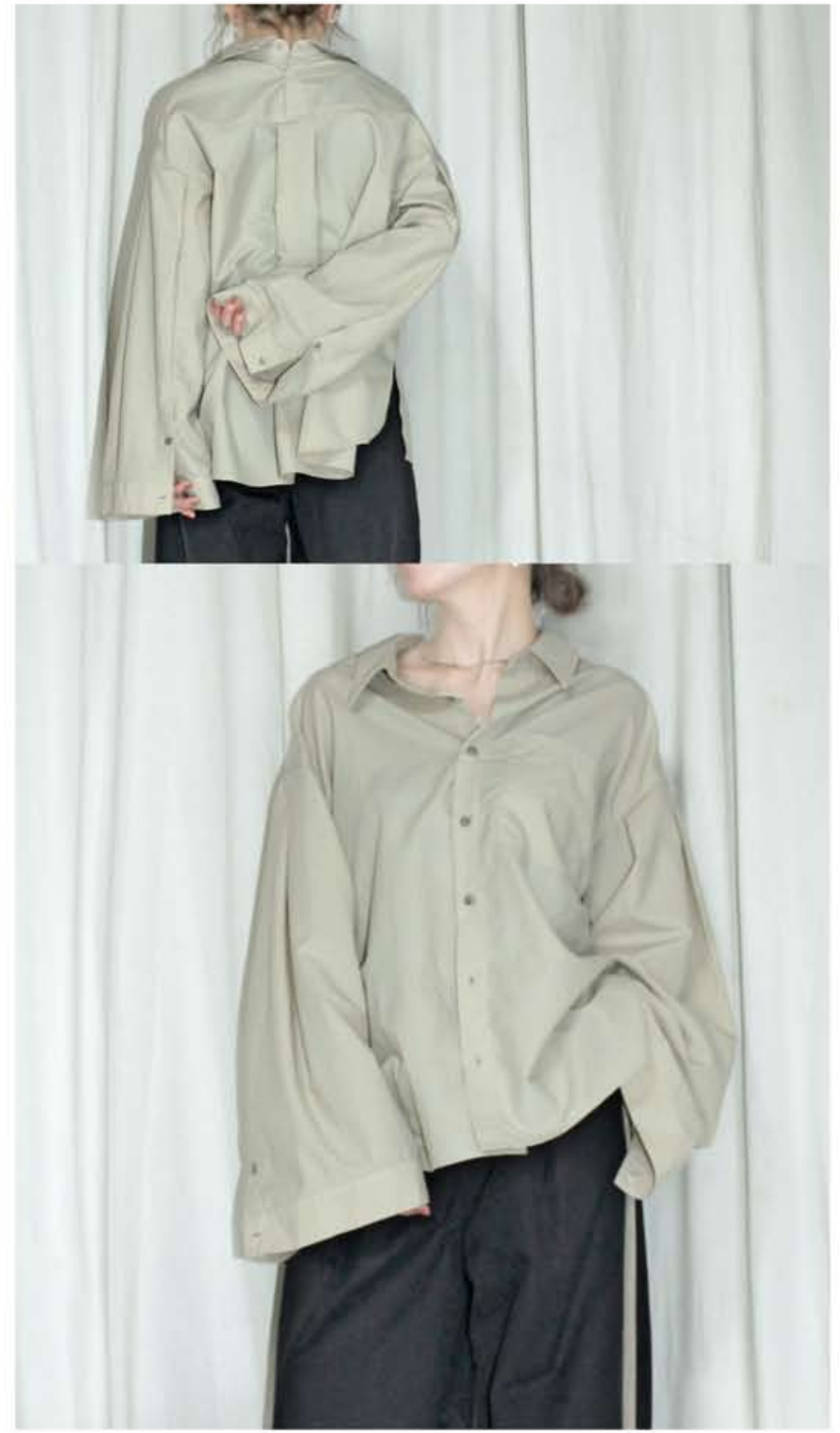
2WAY SLEEVE SHIRT