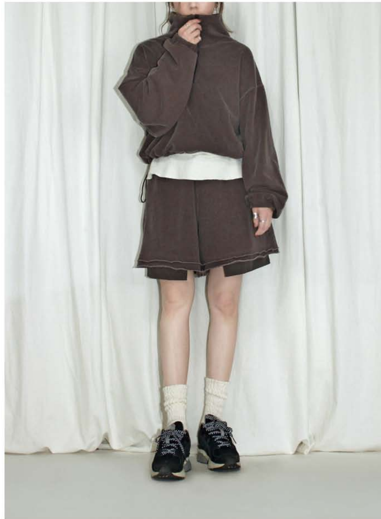
SWEAT HALF ZIP PULLOVER / SWEAT SHORT PANTS