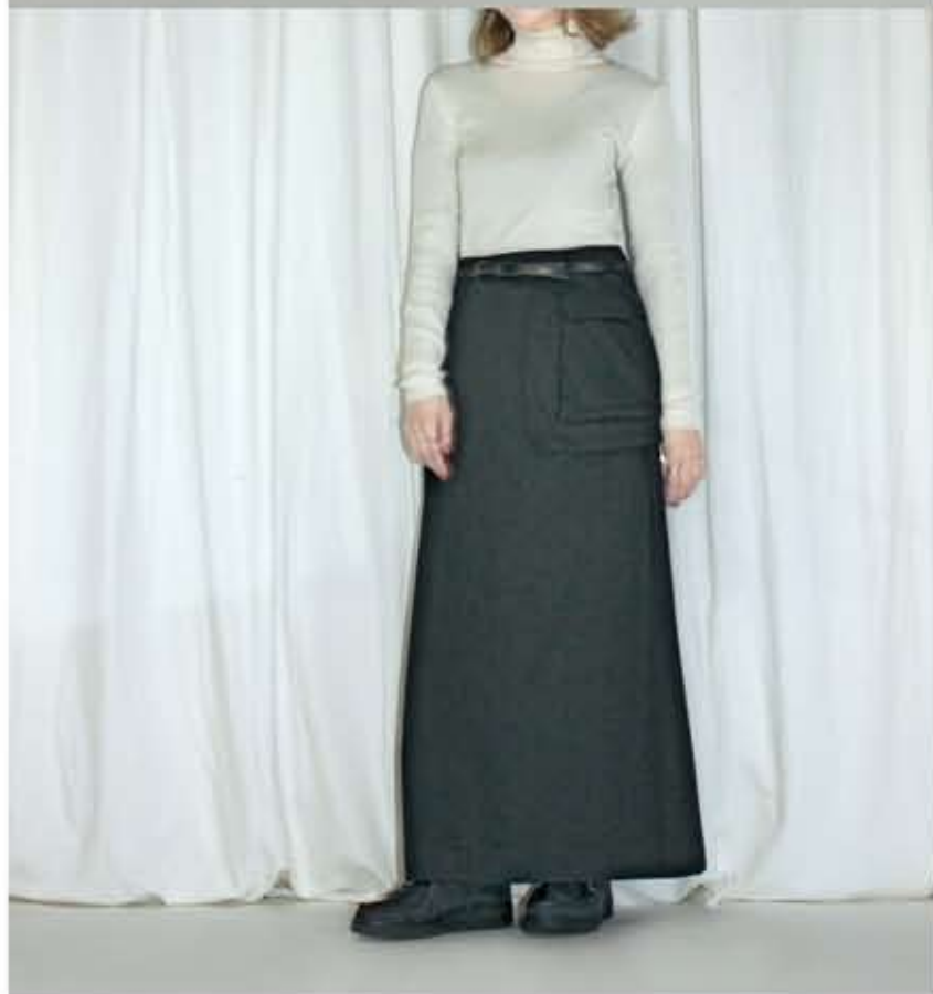
MULTI POCKET SKIRT