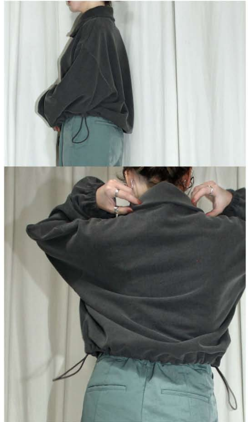
SWEAT HALF ZIP PULLOVER