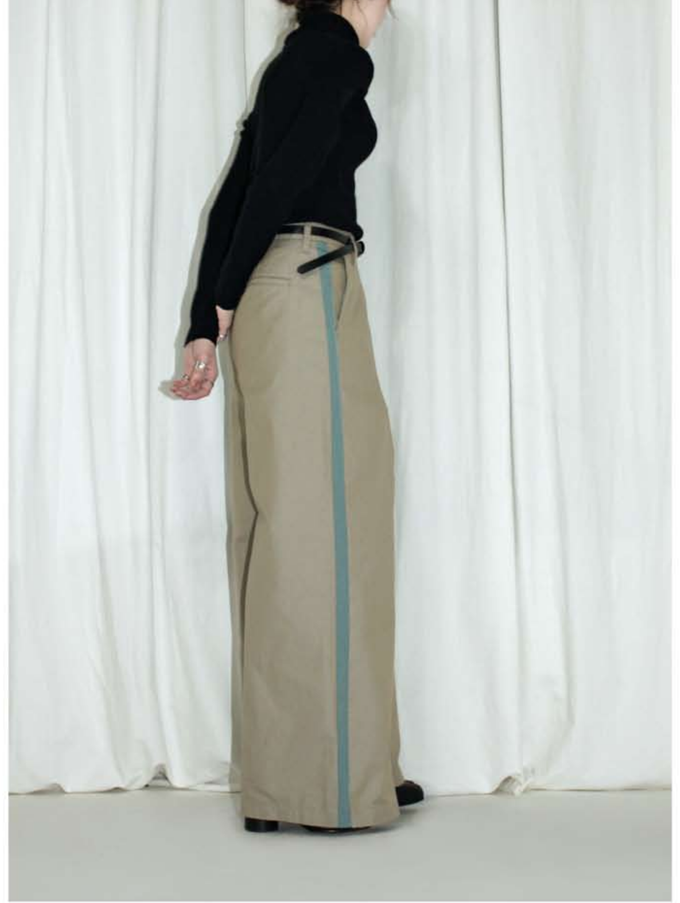
SIDE LINE PANTS