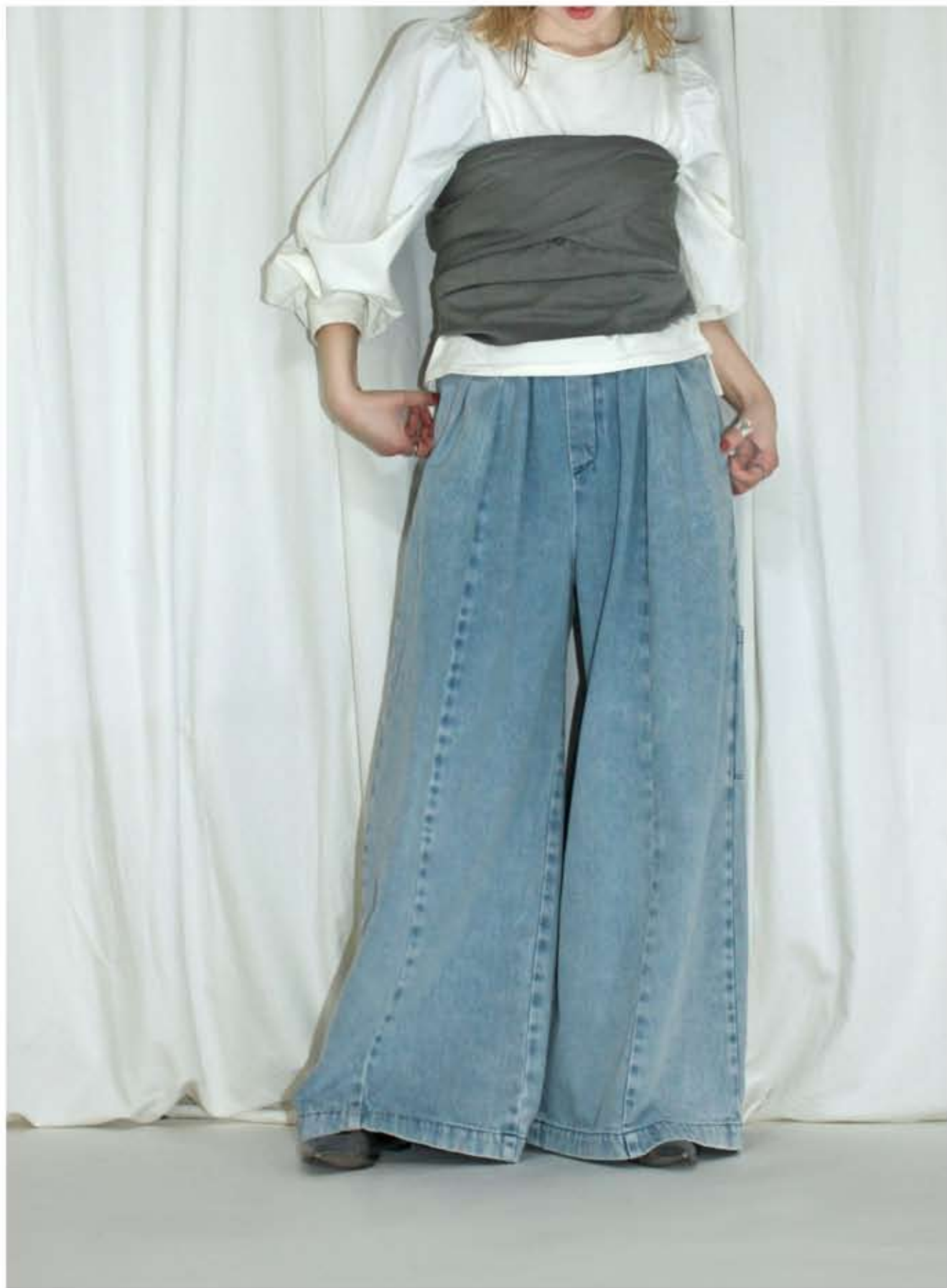
DENIM WIDE PANTS