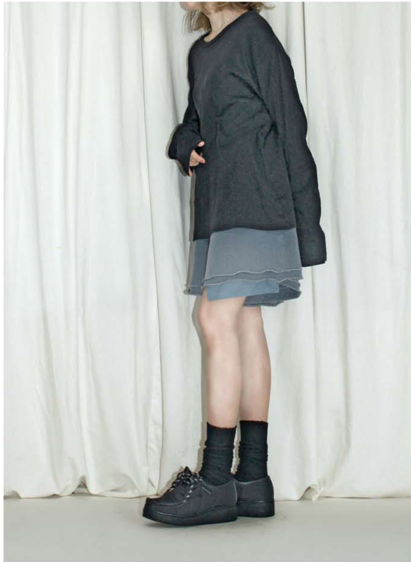
SWEAT SHORT PANTS