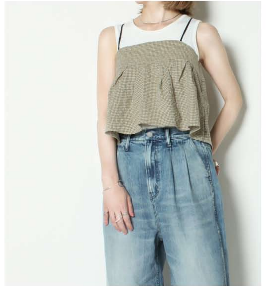
two tuck jeans