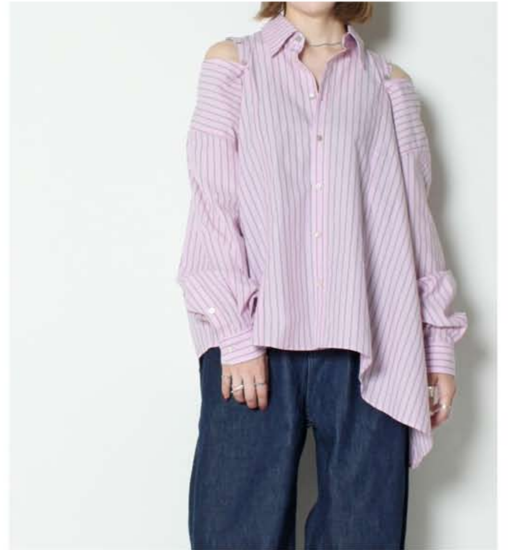
asymmetry shirt / two tuck jeans