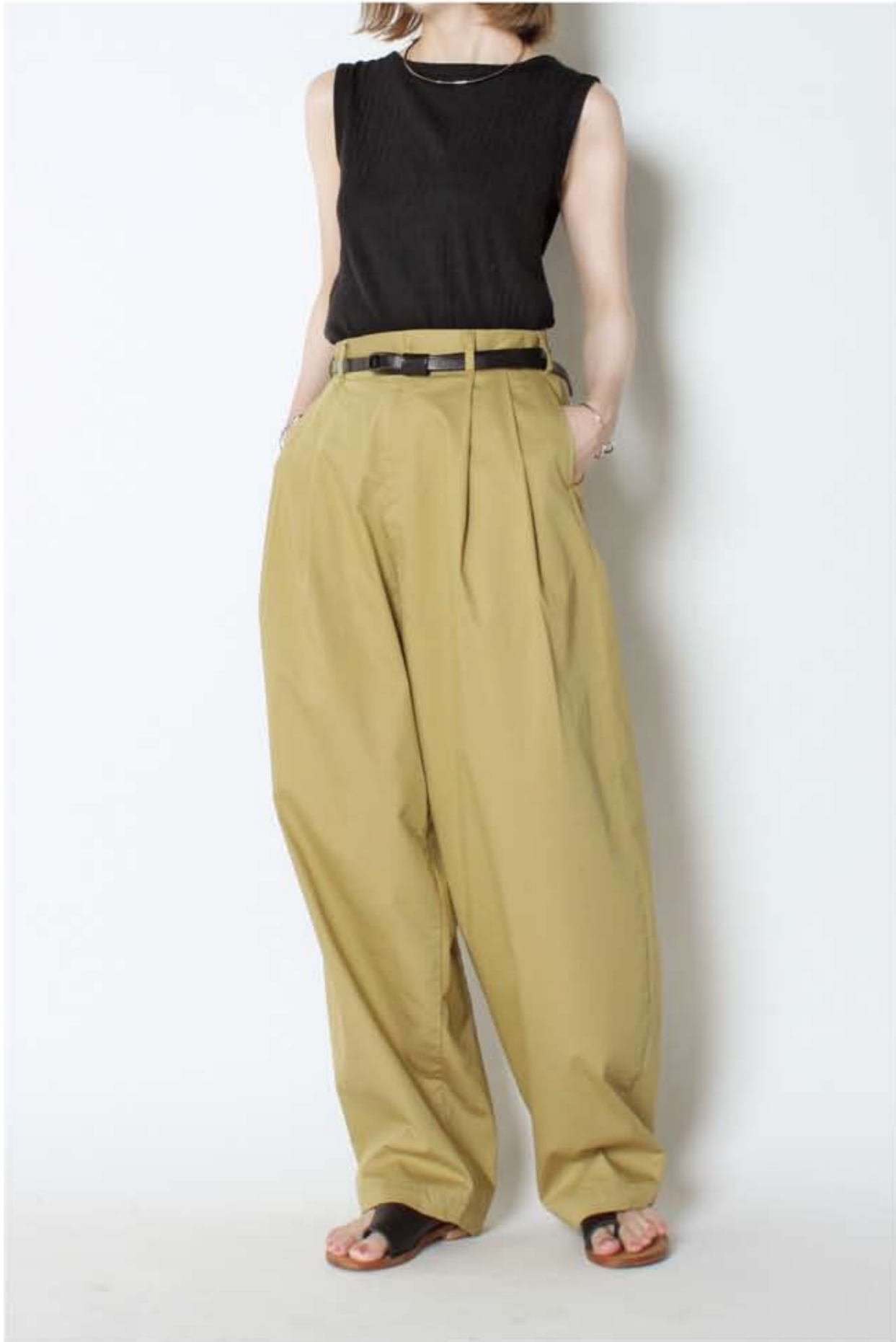
volume tuck pants