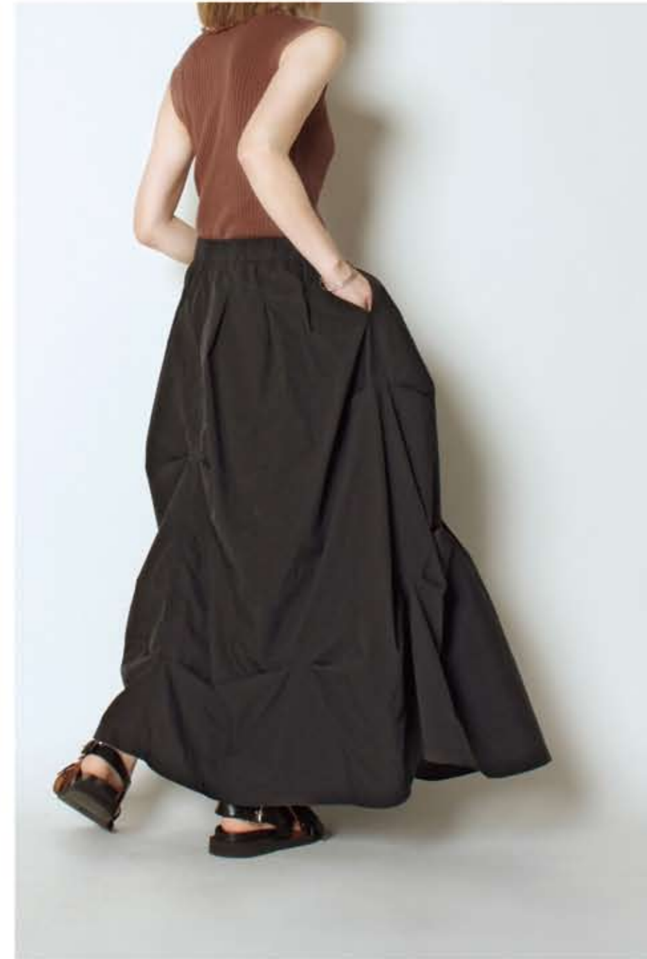
random tuck skirt