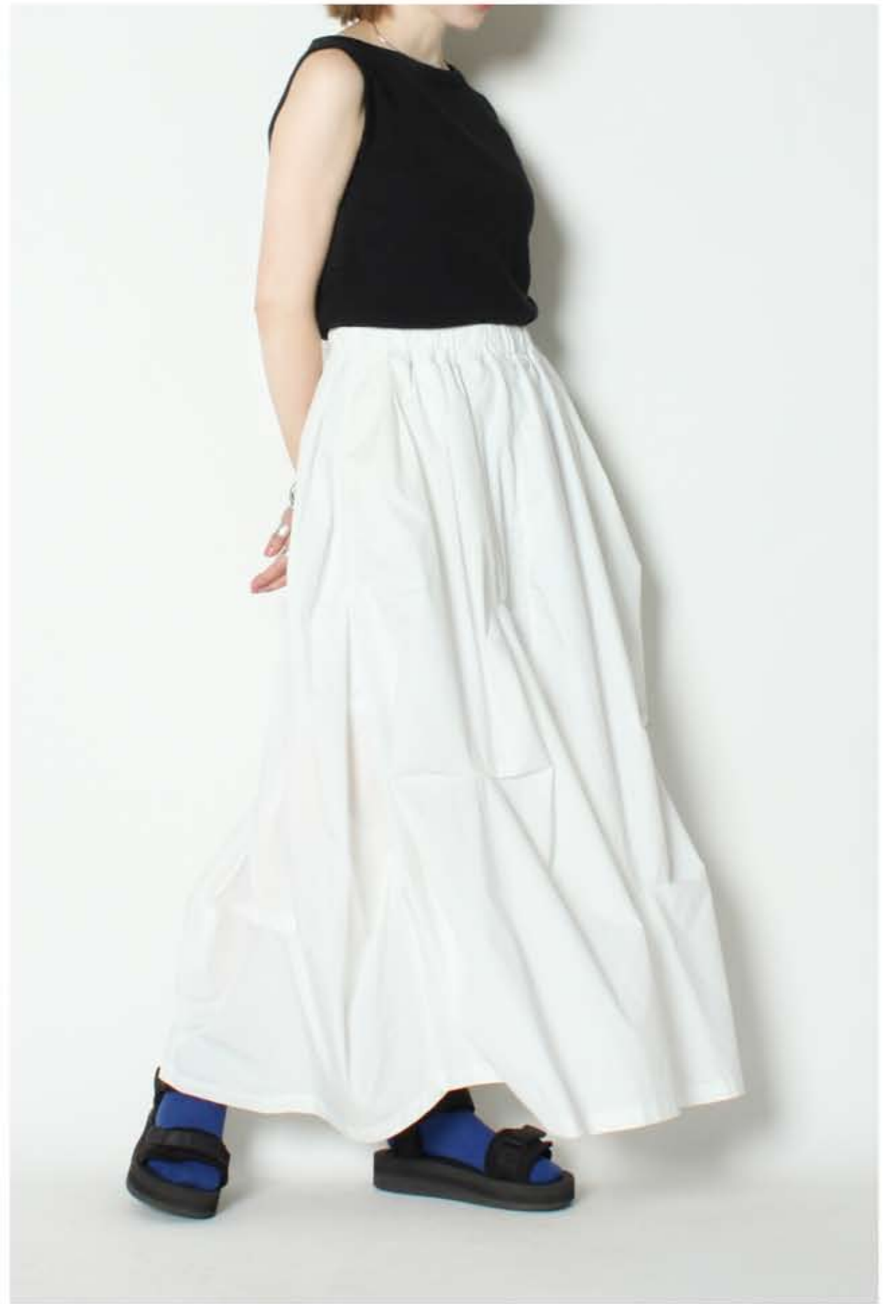
random tuck skirt