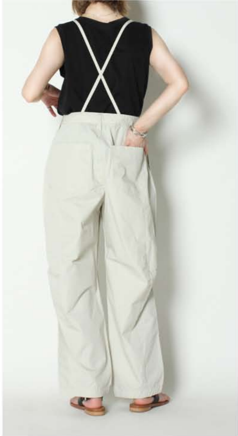
curve salopette pants