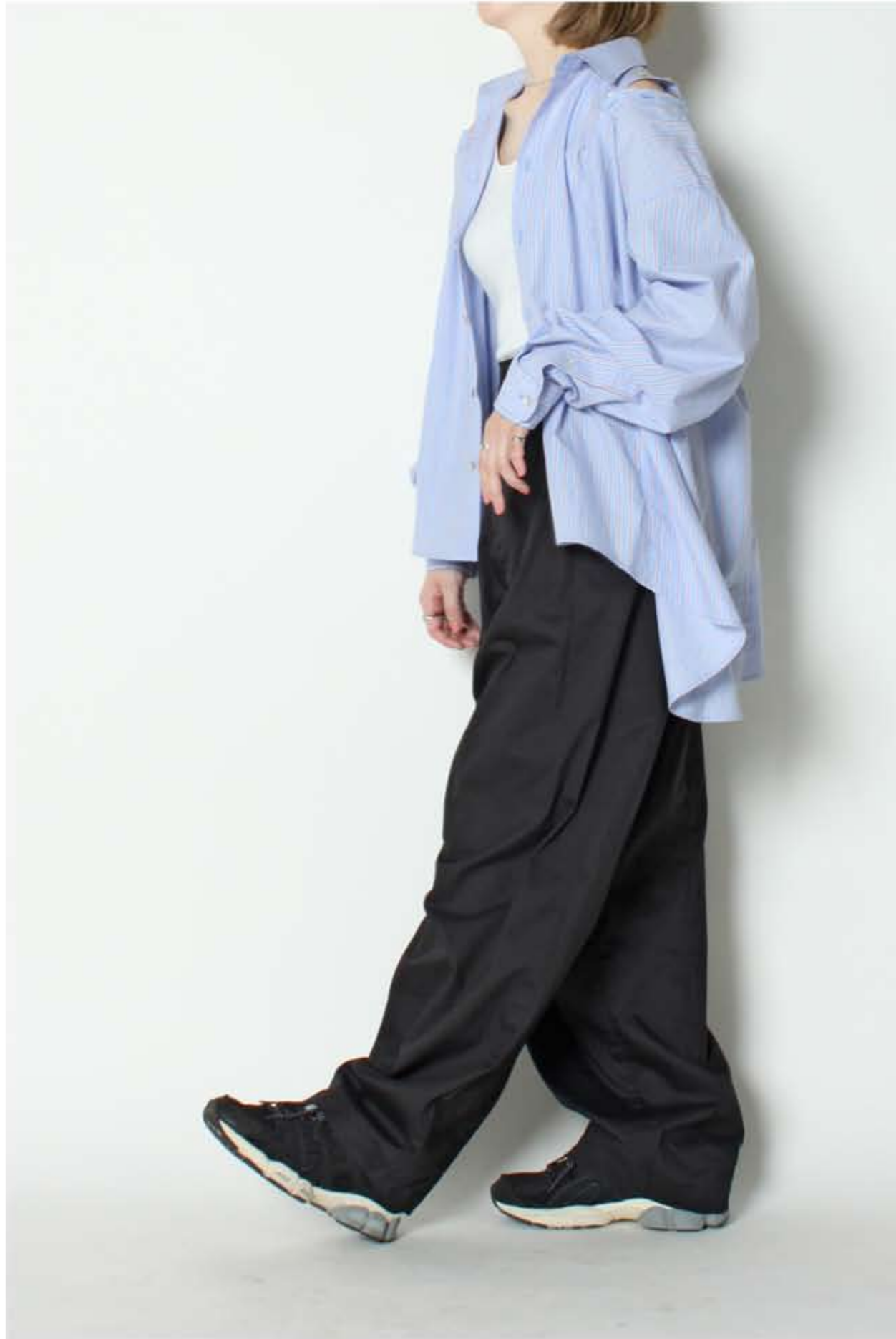
asymmetry shirt / volume tuck pants